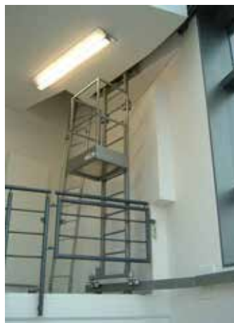
Internal Travelling Ladder with Access Platform