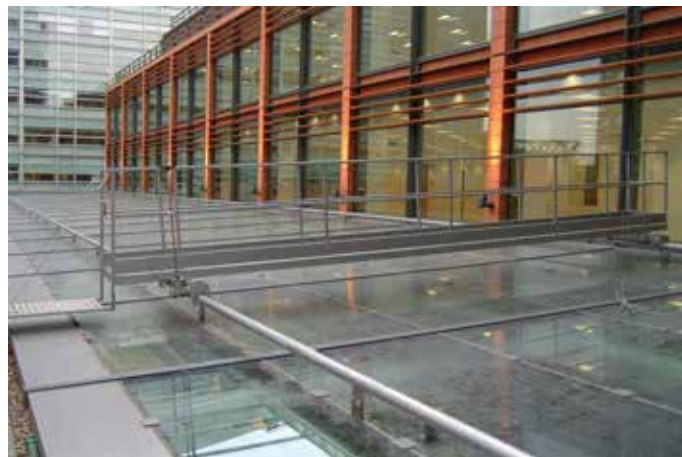
Single Drive Manually Operated Gantry