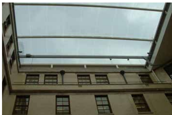
Power Operated Single Beam Gantry