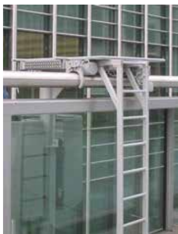
External Travelling Ladder