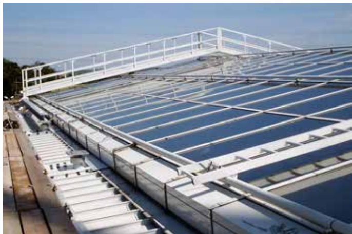
Twin Drive Manually Operated Gantry